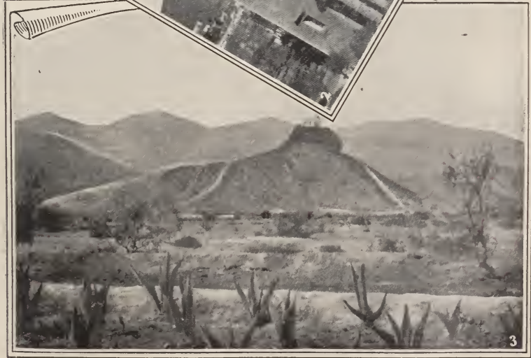
1. CHURCH OF THE VIRGIN OF GUADALOUPE, MEXICO. 2. FRONT OF THE ZACATECAS CATHEDRAL. 3. CAPILLA DEL MADERO, PARRAS.